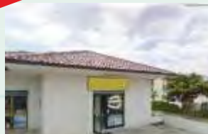
THE LITTLE SHOP WE RENTED IN ROCCA D'EVANDRO

The Anglo-Italian Society for the Protection of Animals Bank: C. Hoarse & Co, 37 Fleet Street, London EC4P 4DQ IBAN: GB51HOAB15990002105010 SWIFT/BIC: HOABGB2L